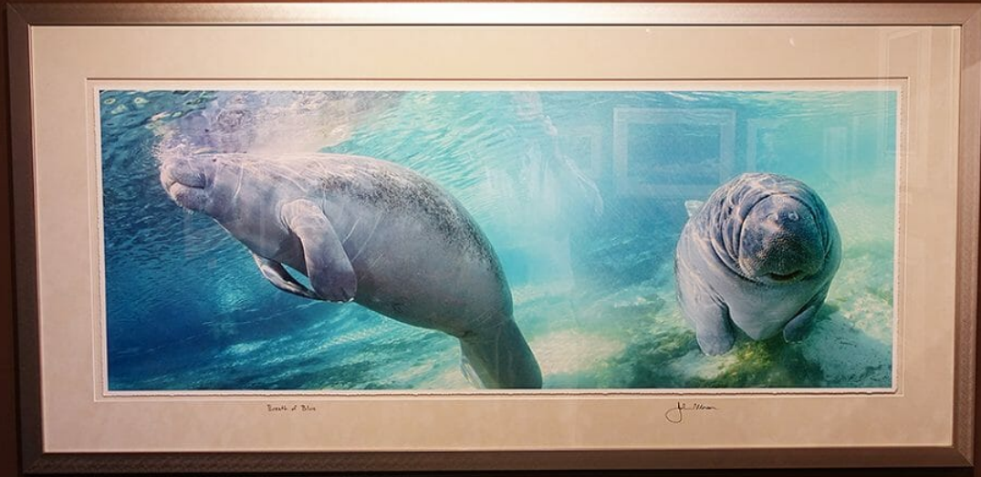
"Breath of Blue" Three Sisters Spring 2012