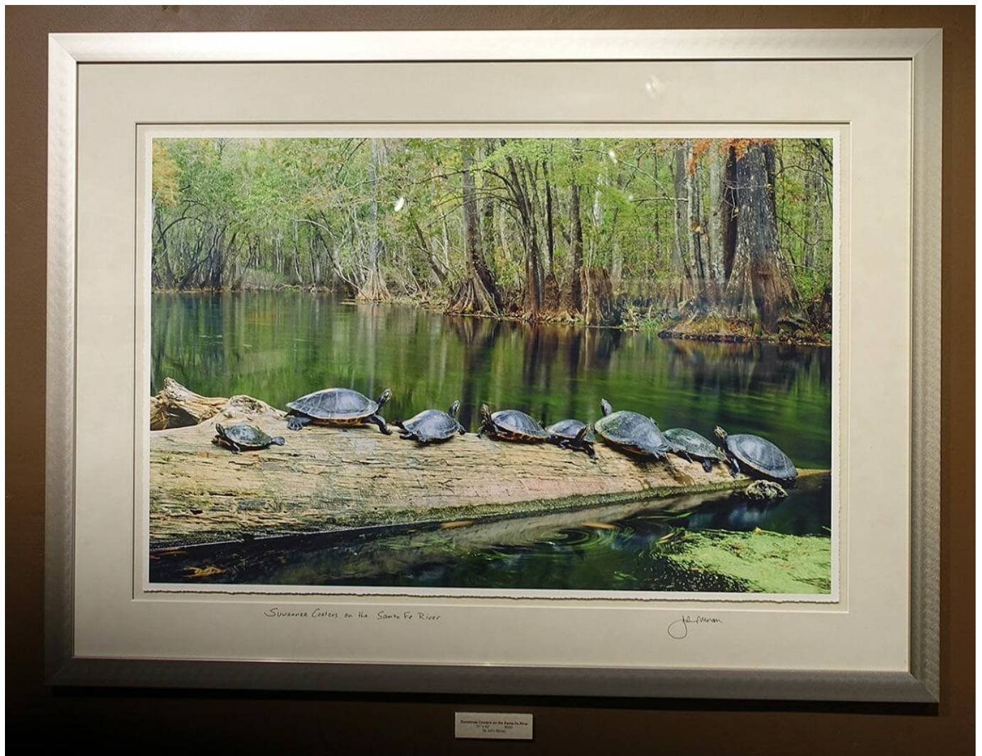
"Suwannee Cooters on the Santa Fe River" 1989