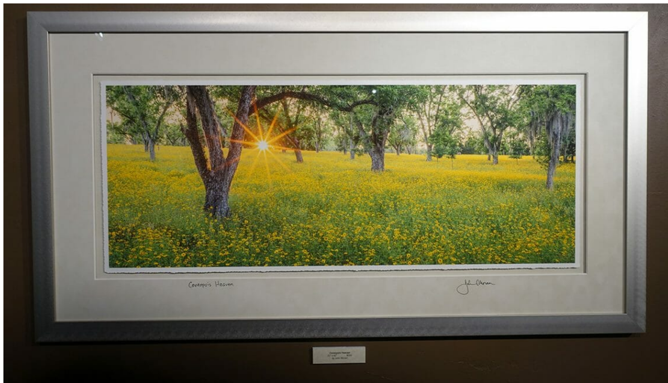
"Coreopsis Heaven" a field between Hawthorne and Melrose 2018