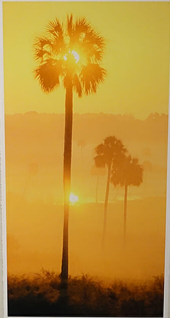
Palms of Meibohm