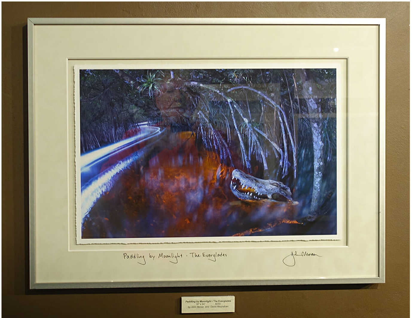
"Paddling by Moonlight" "The Everglades" 2012